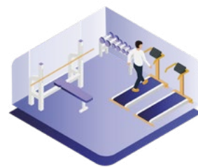
FITNESS & GYMS