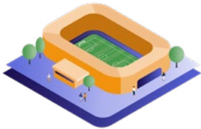
STADIUMS & SPORT FACILITIES